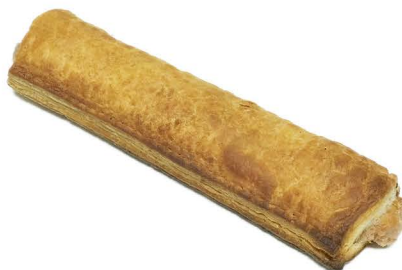
8" sausage rolls