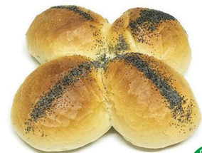
crusty poppy seed batch