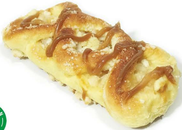
apple & caramel bun