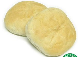
soft white bap