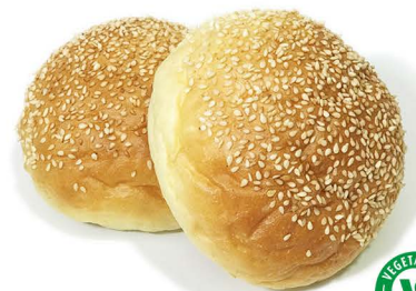
sesame brioche baps