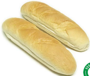
crusty white batons