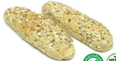
soft granary batons