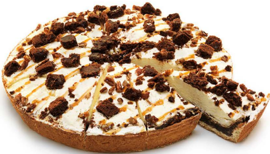
Nutty White Chocolate Cake