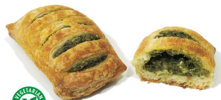
spinach and greek cheese roll