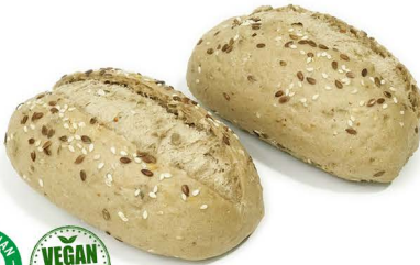
seeded brown crusty bun