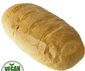
large white bloomer