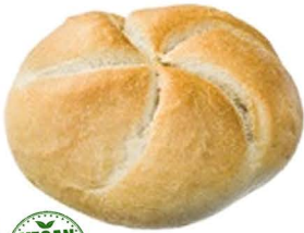
kaiser premium roll