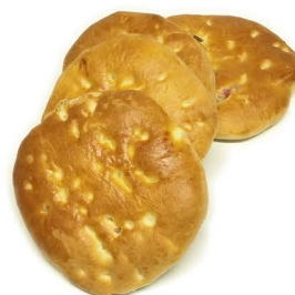
tea cakes (4 pack)