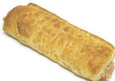
6" sausage rolls