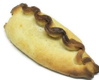
beef & vegetable pasty