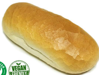
crusty rye sourdough bloomer