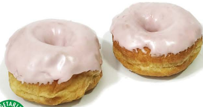
pink ring doughnut