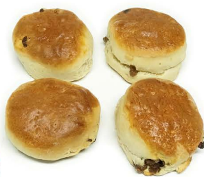
sultana scones (4 pack)