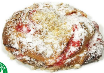
strawberry cheesecake bun