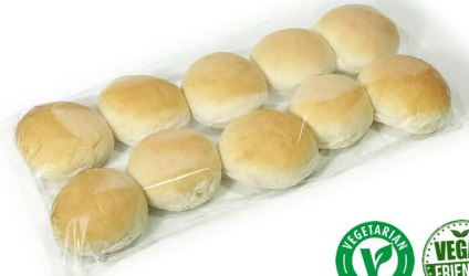
white dinner rolls