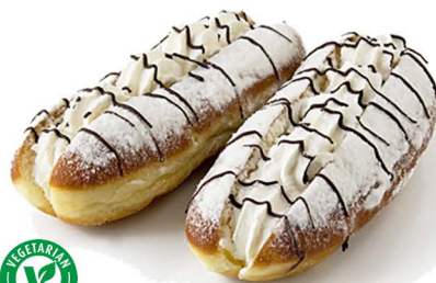
split chocolate doughnuts