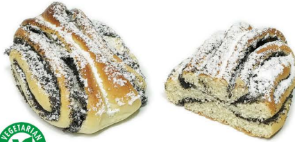
almond south coast delight