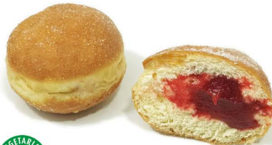
sugar topped jam doughnuts