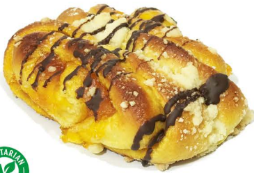
chocolate & orange bun