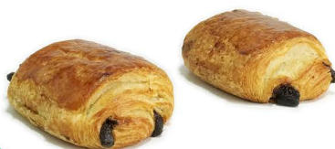
pain au chocolates