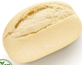
white crusty bun