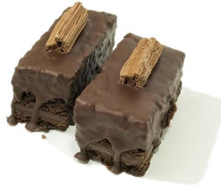
choc nut flake cake