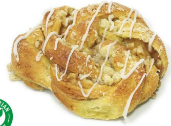
apple & cinnamon bun