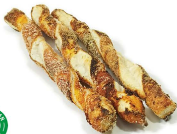
spicy pizza cheese sticks