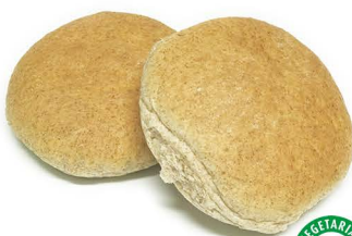
soft wholemeal baps