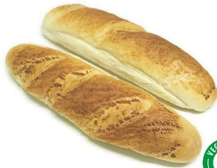
crusty tiger batons