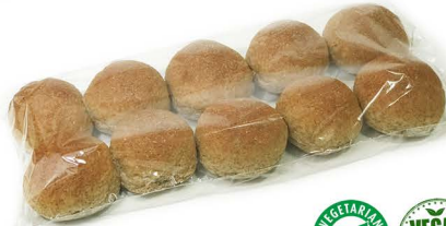
wholemeal dinner rolls