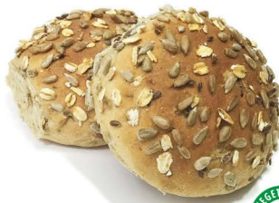
seeded granary rolls