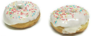
sprinkle ring doughnut