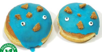
cookie monster doughnut