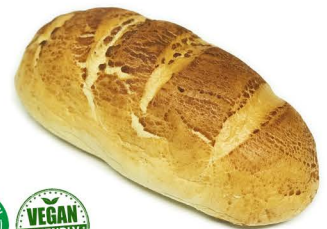
large tiger loaf