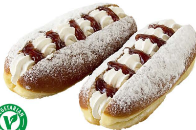
split jam doughnuts