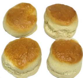
plain scones (4 pack)