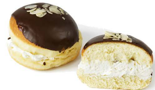
almond chocolate cream