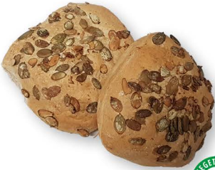
pumpkin seed roll