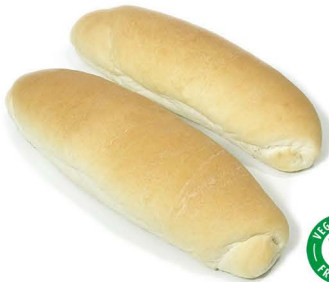
long soft white rolls